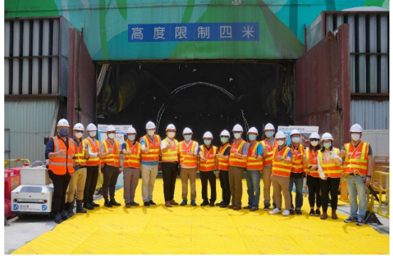
Technical Site Visit on 31 July 2021